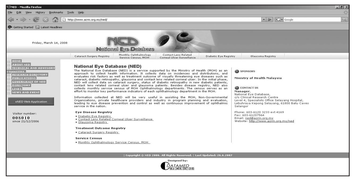
Fig. 1: National Eye Database home page at www.acrm.org.my/ned